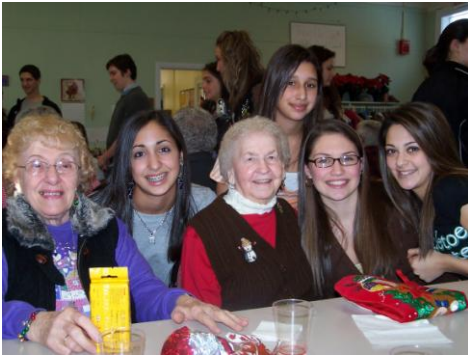
North Branford Students and Seniors